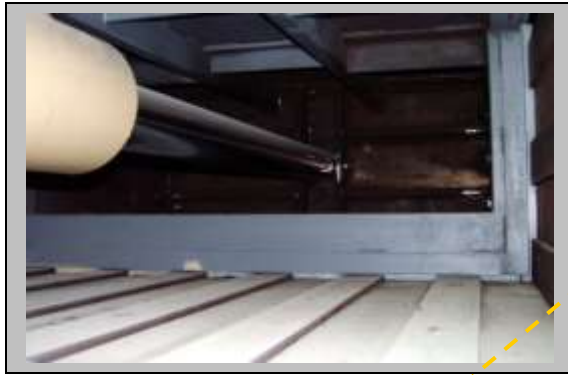
TONGUE & GROVE FLOOR AND WALLS

C&M has designed the strongest compactor compression ram with unequalled wear ability and serviceability...after years of service, change ram wear plates in 45-minutes!